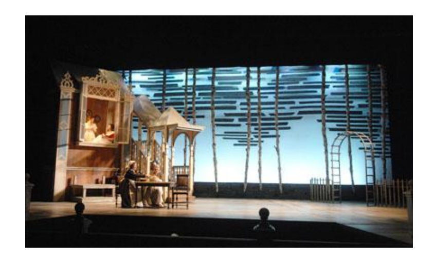
Act I – Scene II (Played on Thrust) | Act I – Scene III (Played Onstage):