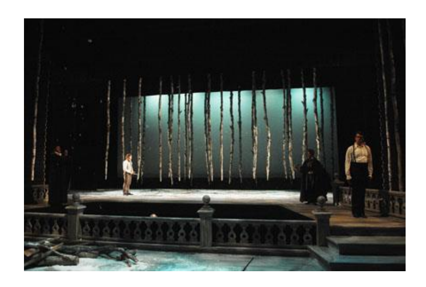
Act III – Scene I (Played Onstage) | Act III – Scene II (Played on Thrust):